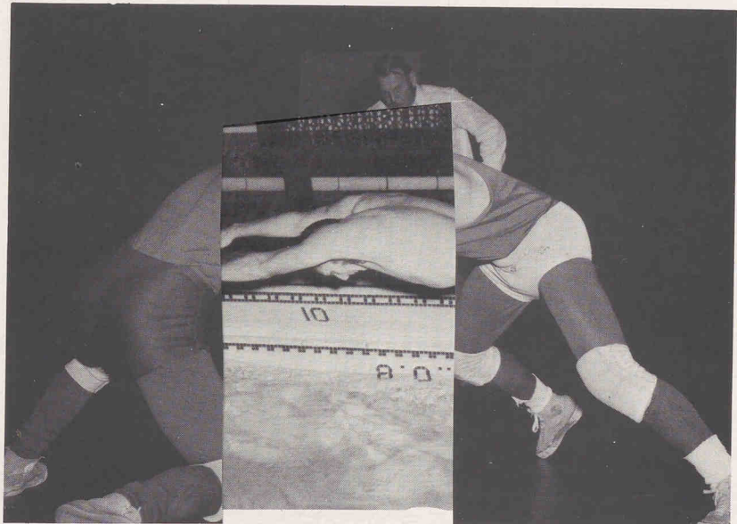
Charlotte Lakesiders 1963-1964 Wrestling