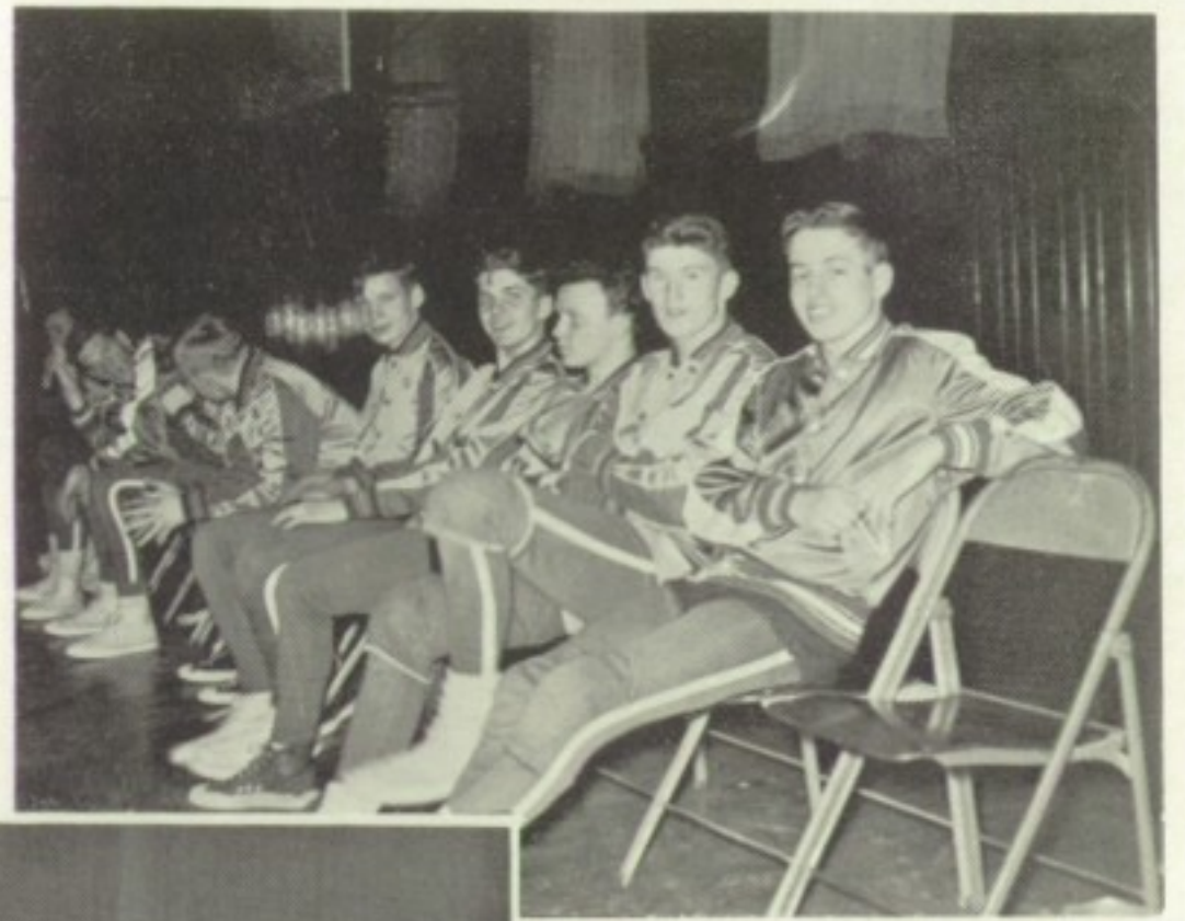
Waiting to wrestle

Since all but three of the boys are eligible to return, a successful season is in sight for next year.