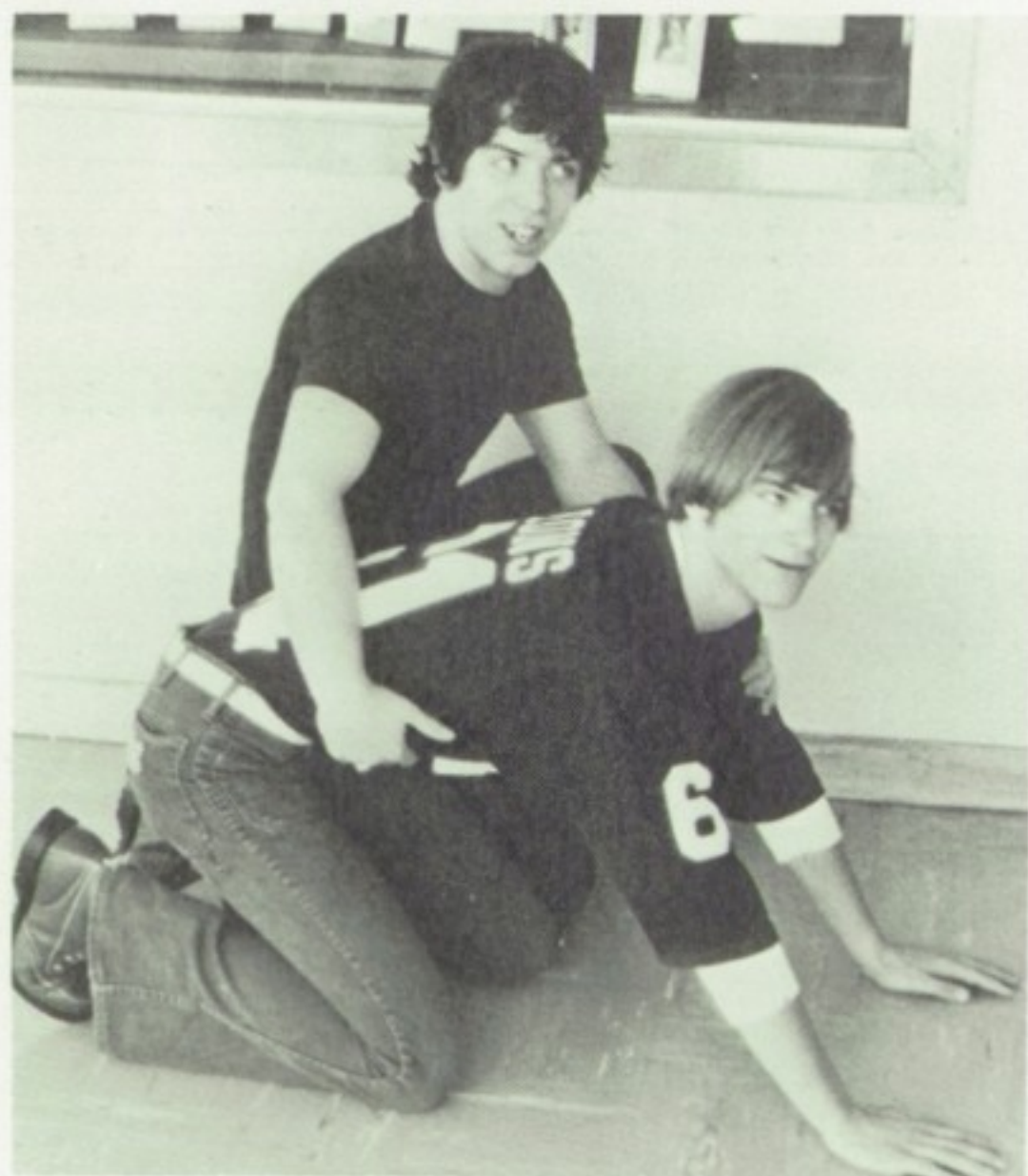
Anyone for leapfrog?