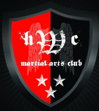
Hand Crafted Warriors Martial Arts Club