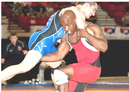
4X Undefeated State Champion/ 2X NCAA Champion/World Team member Teyon Ware in action