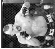
Come Meet UFC Hall-of-Famer Chuck Liddell Nov. 23, 2012

Non-Profit Org. US Postage PAID Albany, NY PERMIT #203