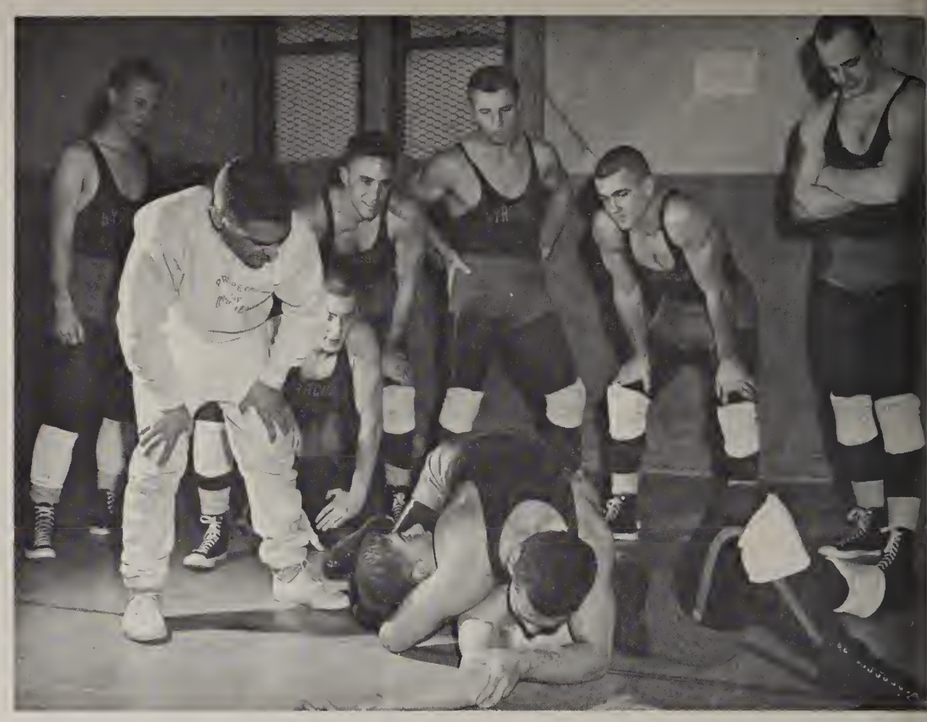
Two Orangemen demonstrate a press at practice.