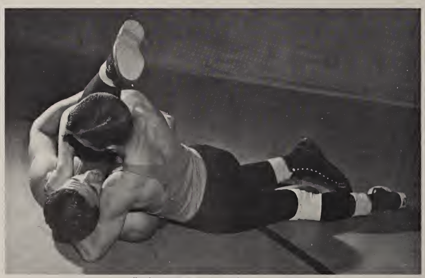
Frosh matmen mix it up during a workout.