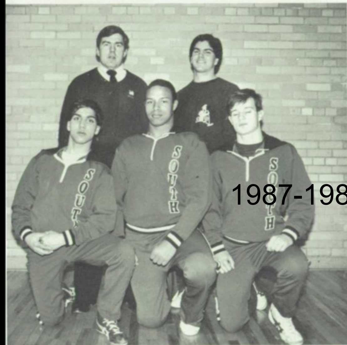
1987-1988 Williamsville South Billies