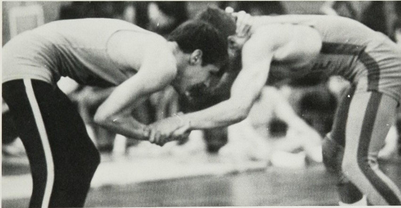
Probing for the opponent's weaknesses is of prime importance in wrestling.