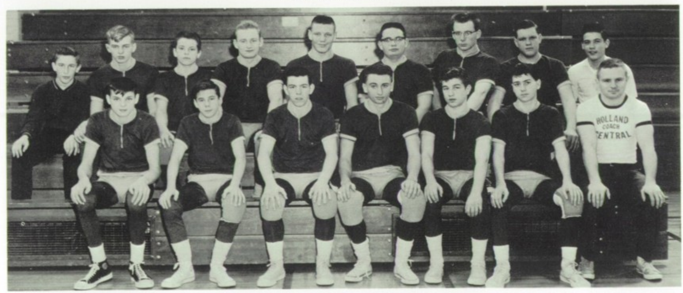
The WRESTLING TEAM of 1963.

Wrestling builds strength and individual courage. It takes a special individual to devote long hours of grueling practice in order to gain the physical condition that is required to exert maximum effort in six minutes of individual combat against an opponent of equal weight. This year's team has shown this intense desire to succeed. Congratulations to the team and Coach Black.