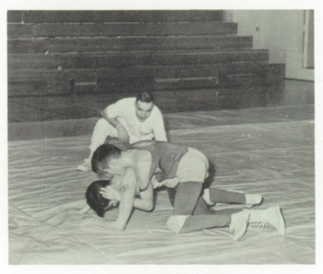
There are many tense moments.