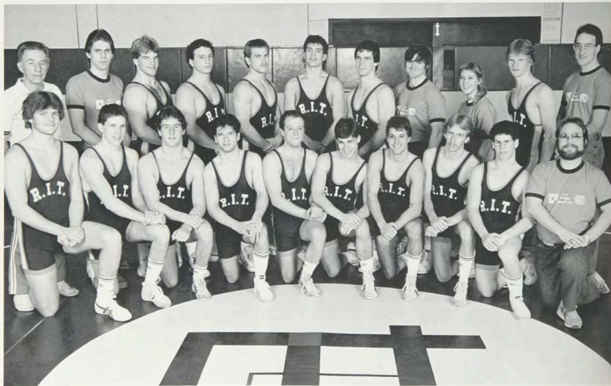
RIT Wrestling Team