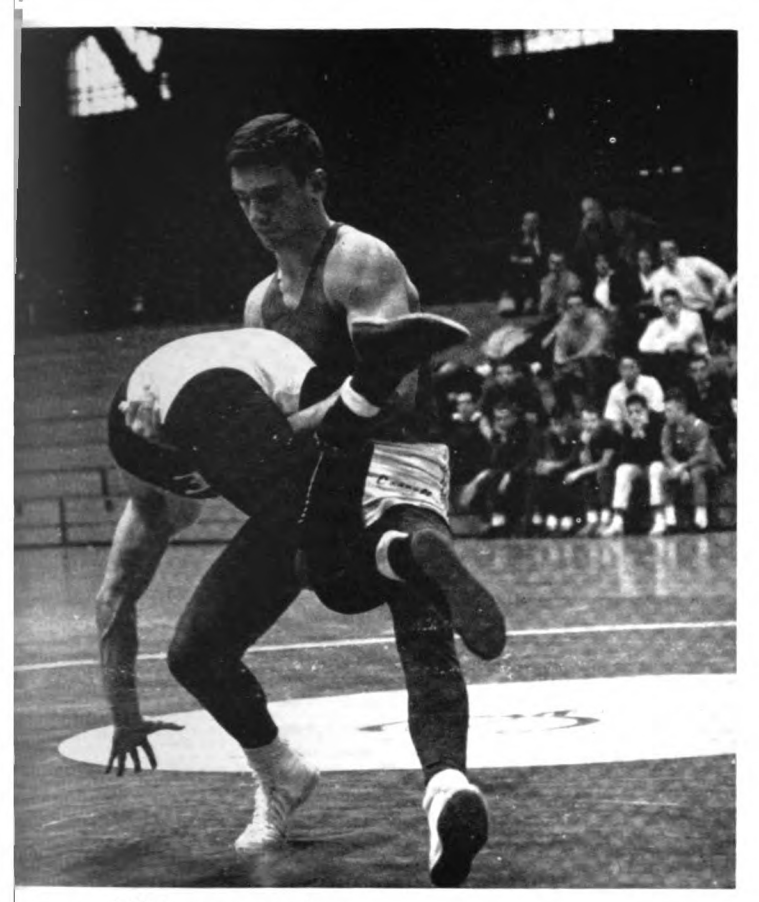
A Yalie gets a ride.

close behind with a 4-0 slate. The 19-14 defeat of Harvard was the tenth Ivy League win in a row for the Big Red, giving them a 4-2 record for the progressing season.