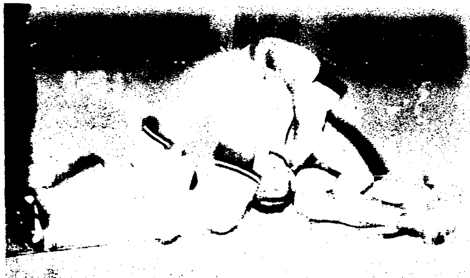
In the grasp