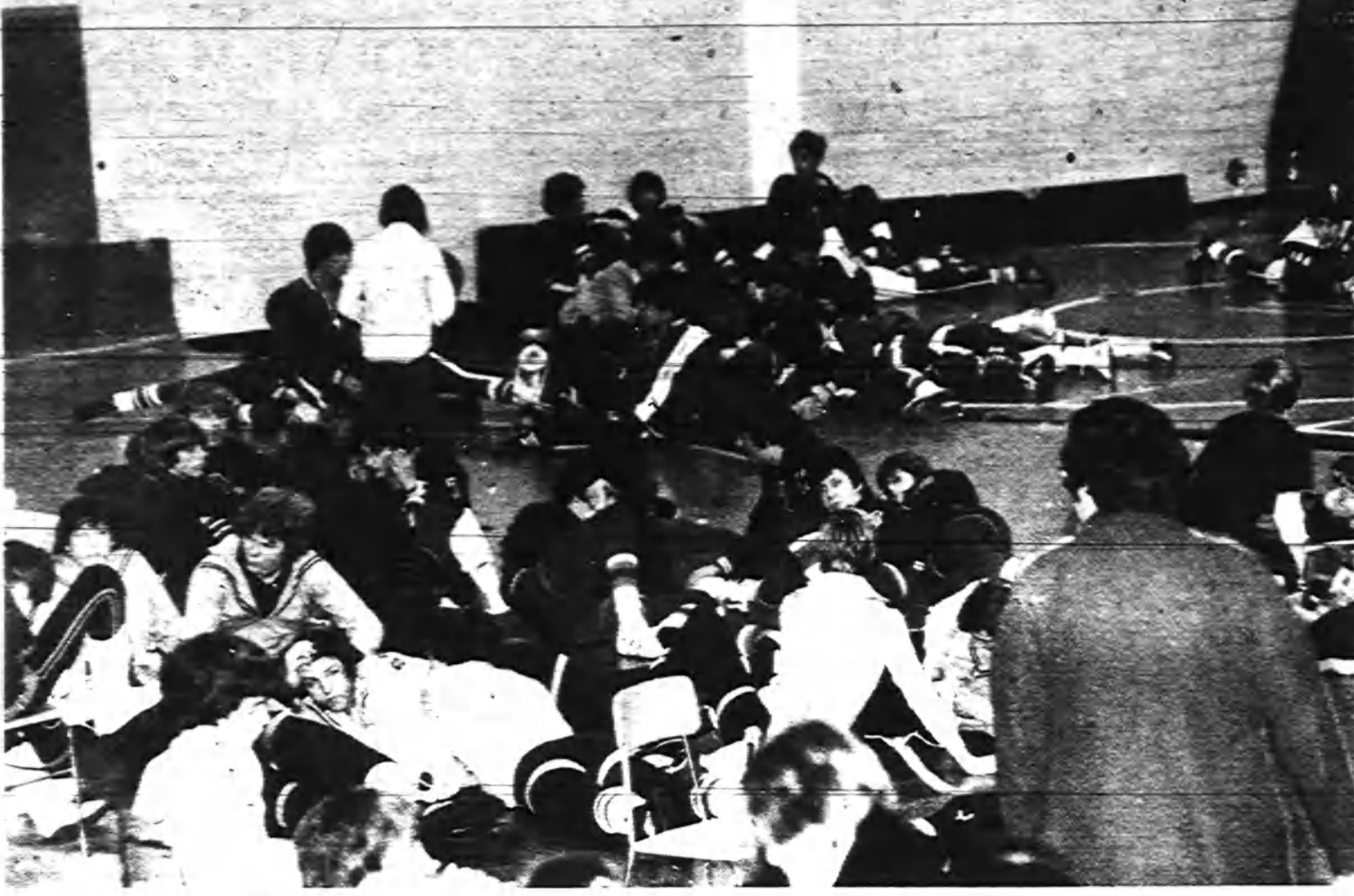
WAITING FOR THE START — Grouped with their teammates, wrestlers crowded on the mats waiting for the start of the sixth annual Salamanca Invitational Wrestling Tournament Friday night as coaches went through some last minute changes in the line-ups for the tournament. A total of 221 wrestlers were on hand for the tournament and were joined by what turned out to be a capacity crowd with four mats in use throughout the night.