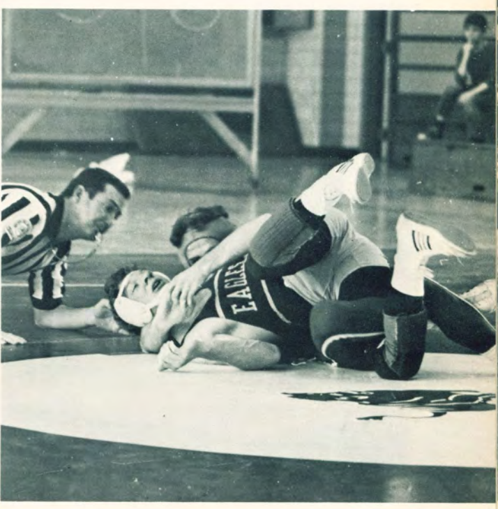
Top left: A Buffalo grappler tries to flip his opponent during the Brockport match. Top right: Leglocked Bull fights to remain on top. Bottom center: A referee readies his whistle as the Brockport and Buffalo wrestlers head toward the mat boundary. Bottom right: A pain-racked Brockport matman futilely struggles to free himself from the tight hold of a UB wrestler.