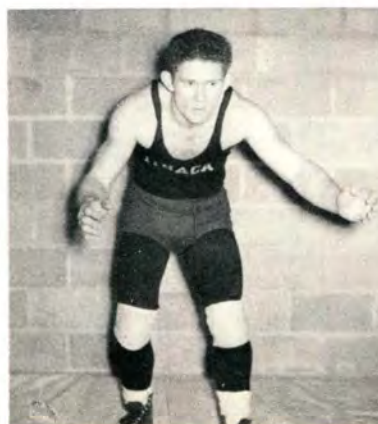
Thomann, Red 167