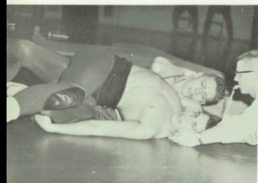
"It looks like a pin, Ref."