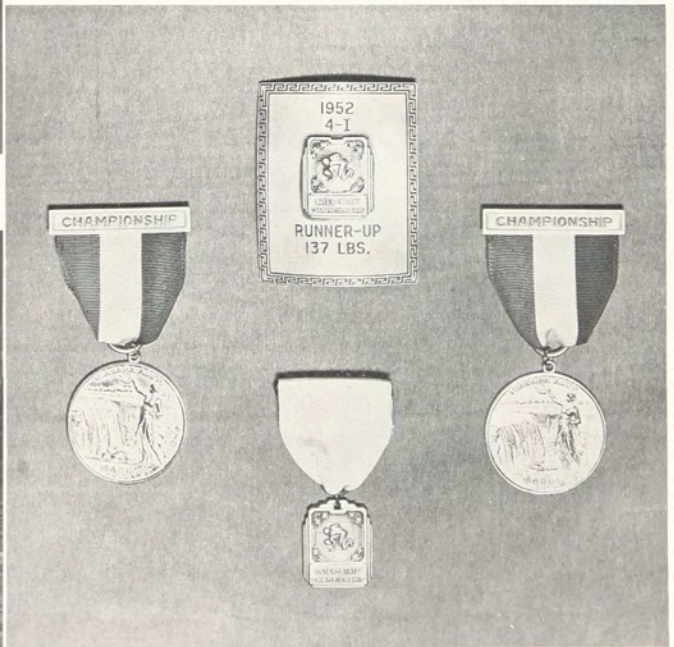
Medals won at the 4-I tournament