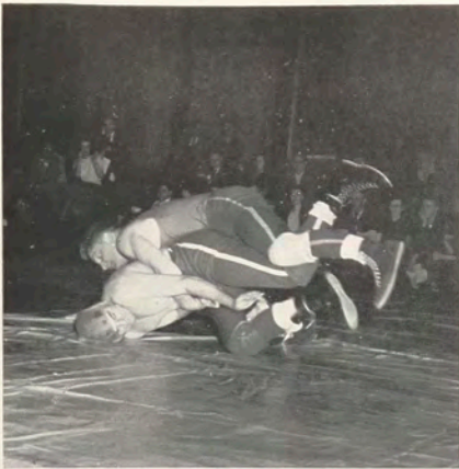
Tight waist ride