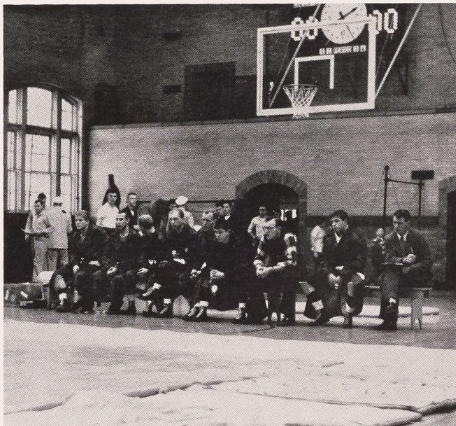
Colgate bench watches action

Colgate ran into a bit of rough going in the next event. Alfred downed the Raiders