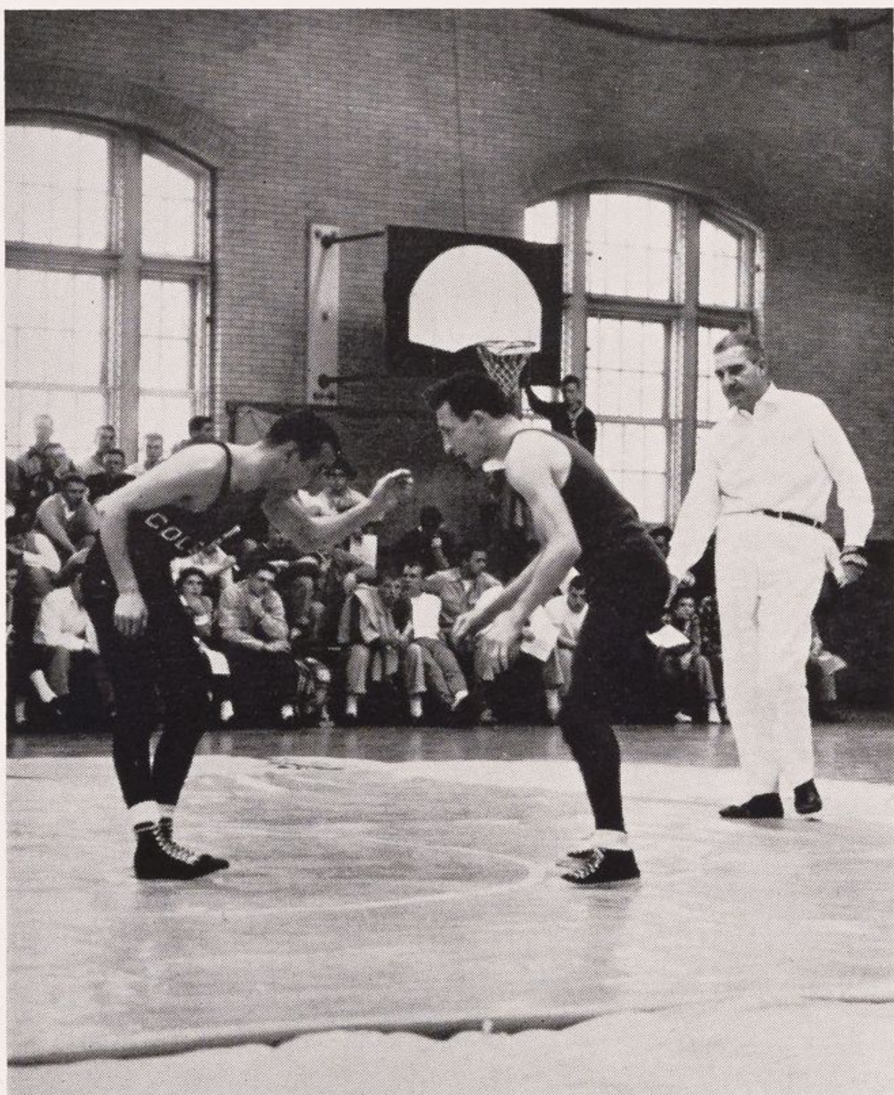
Action in King's Point meet

Playing host for the first time, the Raider matmen entertained the wrestlers of King's Point. The outcome wasn't entertaining as the visitors defeated Colgate 17-13, to give the Raiders their third defeat against one