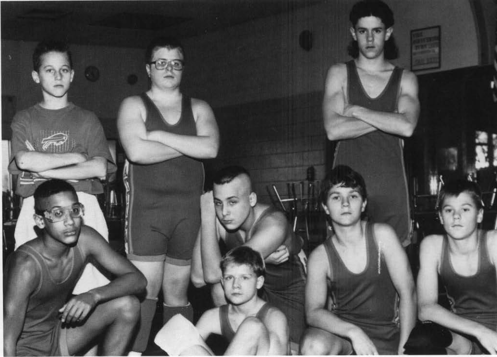
Attica Blue Devils 1992-1993 Wrestling