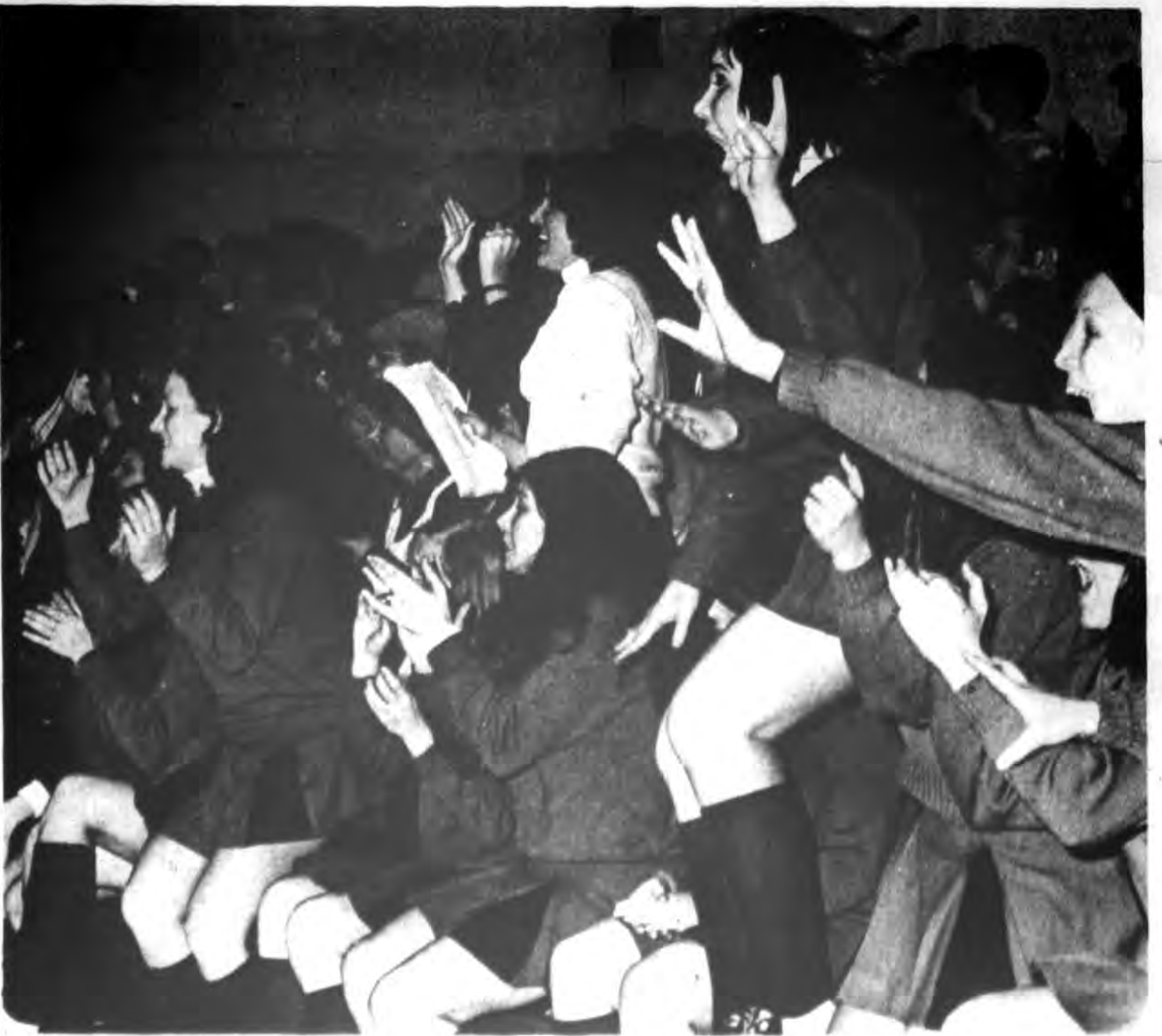
Wayne cheerleaders find moment of happiness.

ended Richard Petty's domination of the Fairgrounds Raceway with a threesecond victory in the Richmond 500.