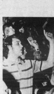
Following Jones stirring fall at 177, the Cowboy faithful break out in a "We're no. 1" chant.