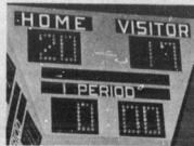
The scoreboard tells the whole story as the Pokes upset the No. 1 ranked cyclones.