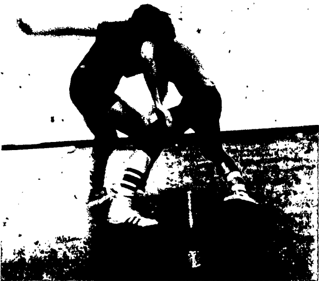
CARDINAL GRAPPLERS WORK on takedowns during a recent practice. After a slow start the Cards have filled all available positions and are on to another winning season. The season opens with a key match versus rough Potsdam on December 4.