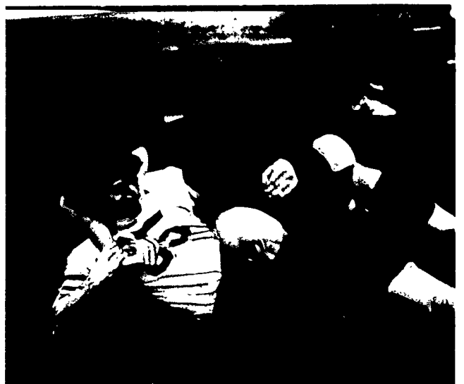
WITH A MIXTURE of old and new faces and added strength in the upper weight divisions, the St. John Fisher wrestling team hopes to repeat its role as a contender in the Eastern U.S.