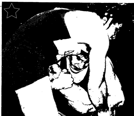
Woody Vandenburg controls Scott Slade of UB