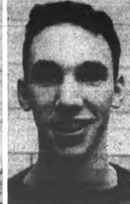
.... 112 pounds