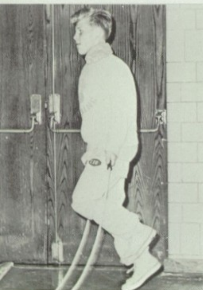
"Come on boys, you can do it."

"I'm a little sailor boy, dressed in blue . . ."