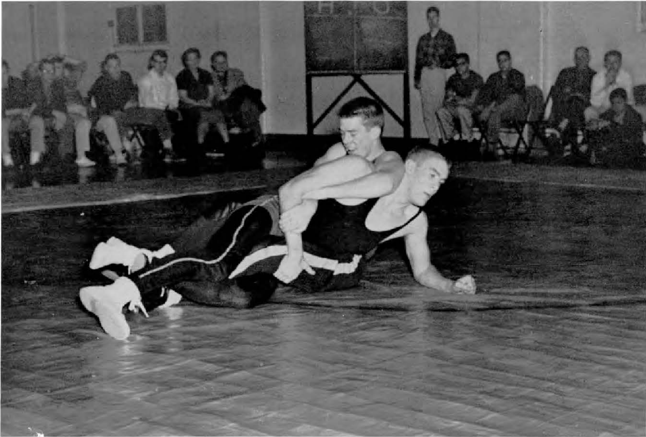
Bott fights a cross body ride.