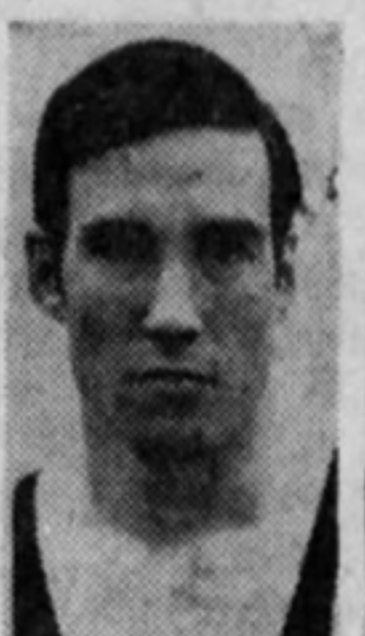
Carr 168 Coon