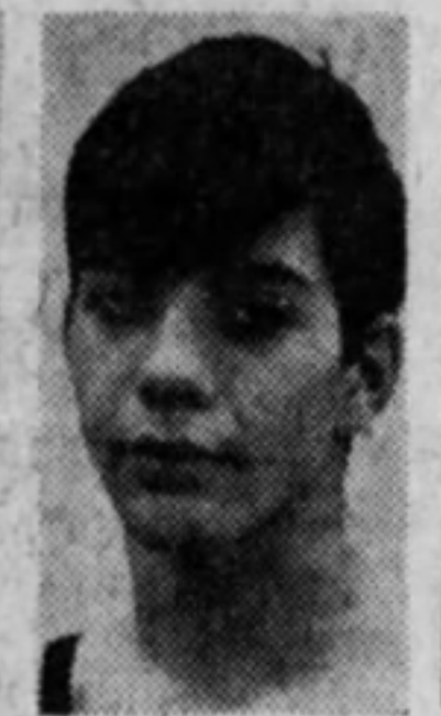
Losito 136 Sherman