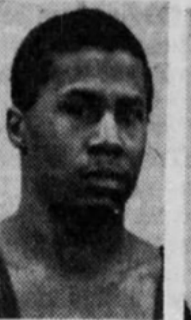
Greene 183 Manchester