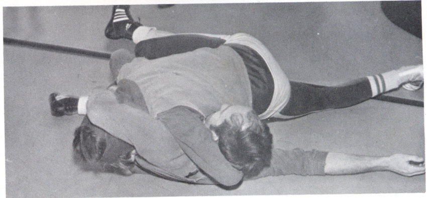
Coach nearly gets pinned.

This year's varsity wrestling team had an overall record of 12 wins and 4 losses. In the Genesee Region League the team compiled a perfect 9-0 record which gave them the championship. They also won the Genesee Region County Tournament at the end of the season. With many returning veterans and help coming up from a strong JV team, next year's prospects look very good.