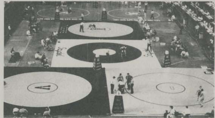
PICTURE ABOVE SHOWS RESILITE WRESTLING MATS AT THE 1989 NCAA CHAMPIONSHIPS HELD IN OKLAHOMA CITY.

WORLD'S LARGEST ATHLETIC MAT MANUFACTURER