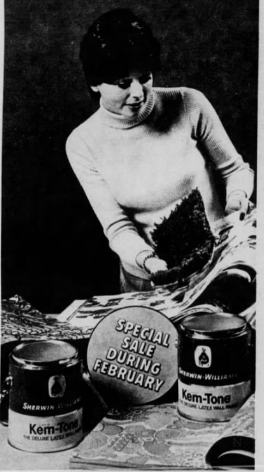
During February 15 patterns of self-adhesive wallpaper are specially priced.

When you're ready to wallpaper, you're ready for Sherwin-Williams.