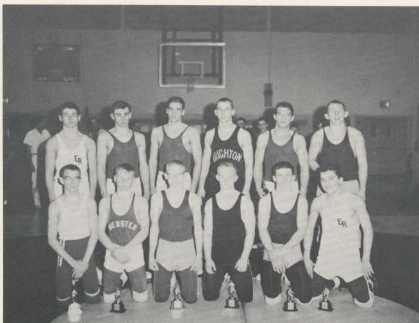
The Monroe County Champs