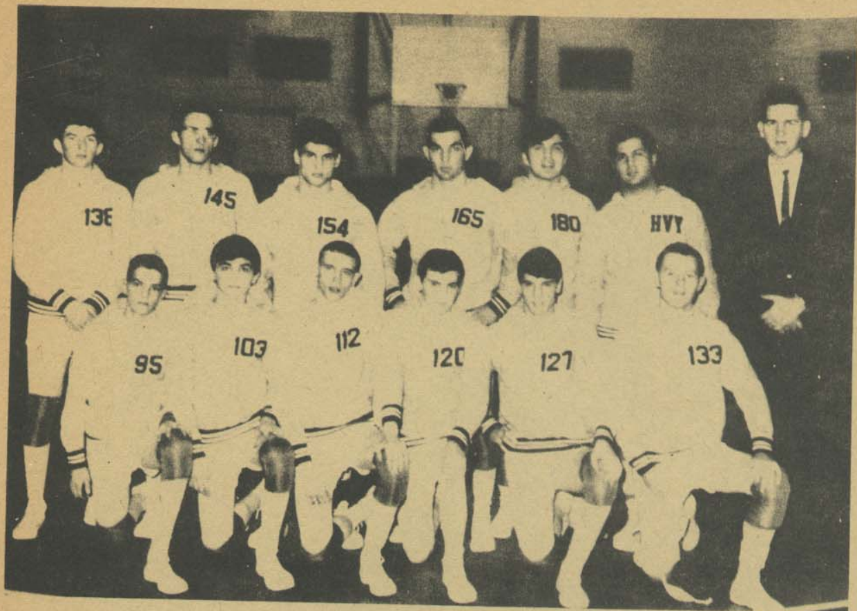
LAST YEAR - Eastridge team (top) won Monroe County title but did not meet Greece Olympia except in the County Tournament.