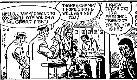
THE JACKSON TWINS