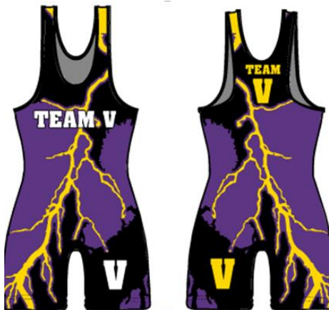
TEAM FIVE SUBLIMATED SINGLET

SIZE: S M L XL QUANTITY: _____ $ 70 Each