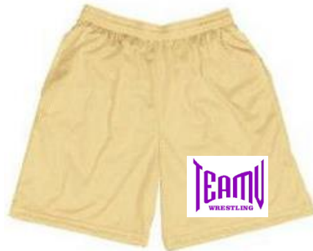
VEGAS SHORT PURPLE STRIPE

SIZE: S M L XL QUANTITY: _____ $ 26 Each