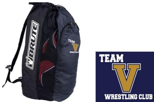
BRUTE GEAR BAG

ONE SIZE FOR ALL QUANTITY: _____ $ 35 Each