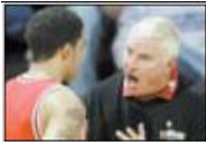
Bob Knight reaches a coaching milestone at Texas Tech. 2C